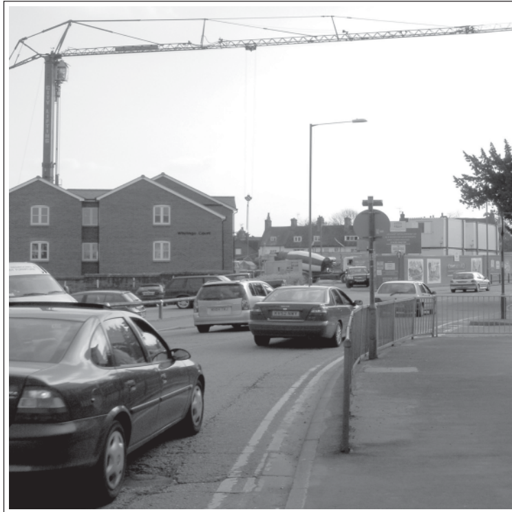
“Brookers” site on Paynes Park, looking west