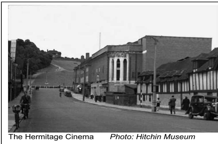
The Hermitage Cinema

of 'talking pictures' in its stride. It was taken over by the operators of the Hermitage, and was briefly renamed the Regal in 1935 and closed in 1937.