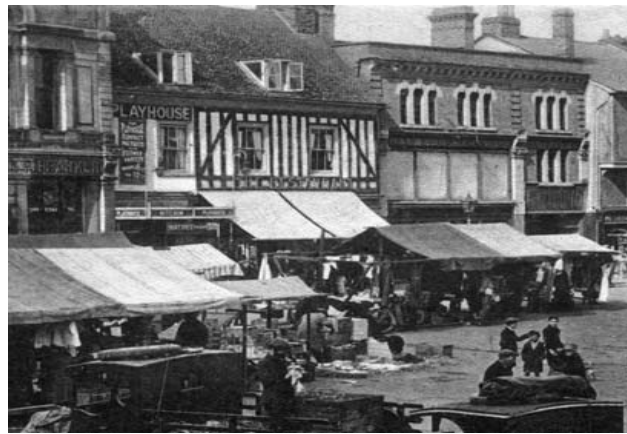
The Playhouse

The success of the Picturedrome encouraged others to start the 760-seater Playhouse, a curious building accessed from a front door on the Marketplace immediately to the north of the Corn Exchange: a long corridor ran through the building then on the site, into the cinema itself at the back. The Playhouse opened in 1913 and flourished, taking the introduction