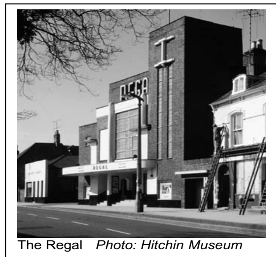
The Regal

Thus came to an end 66 years of cinemas in Hitchin. Why? In 1933 Hitchin had three cinemas at once – the Playhouse, the Picturedrome and the Hermitage. There were then – and clearly are now – audiences to be had. Ask young people in other cinema-free towns what they want most, and a cinema will be high on their list. The arrival of DVDs and downloads of recent films, whether legitimate or not, are no substitute for the sociability of a shared experience. The product itself need not be up-to-date: a film club thrives in Letchworth right under the shadow of the triplex cinema there: art and experimental films may not be everyone's cup of tea, but there are enough people interested to make occasional showings viable.