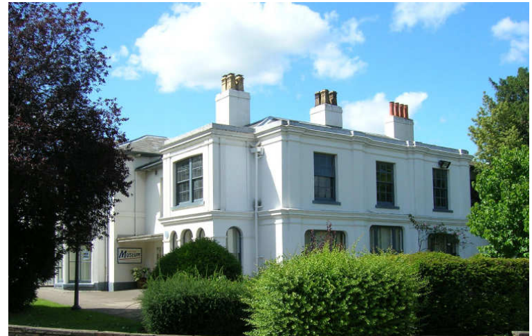
Clockwise from top left: Hitchin Priory, The Biggin, Hitchin Museum and St Mary's Church (all open, Heritage Open days, 2009)