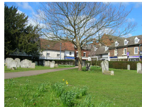
Bucklersbury, Hitchin (top) Churchyard, Hitchin (above) More pictures on next page